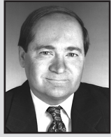
American Window Film, Inc.

"Roller coaster" has been used so often the past few weeks when describing "the market" that I'm feeling a little queasy from the slow upward rises and rapid steep declines. Financial wizards' and stock market gurus' demeanor of discourse has been running the gamut of emotions from guarded optimism to calm resolve to wild and