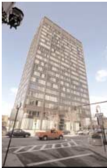
Hampshire Plaza East Side Before